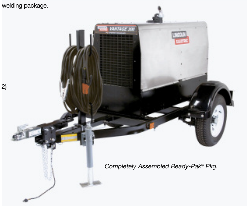
Completely Assembled Ready-Pak® Pkg.