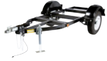
K2636-1 Medium Welder Trailer